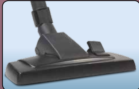
ProFlo high efficiency combination floor tool