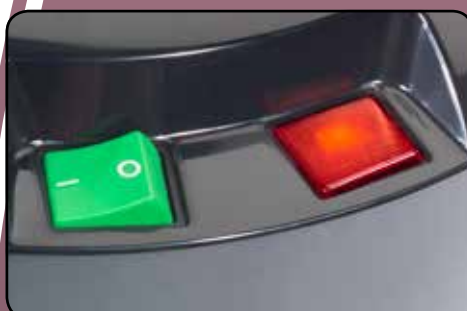
Power on indicator light