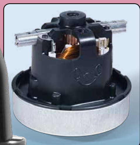
Numatic high efficiency long life motor