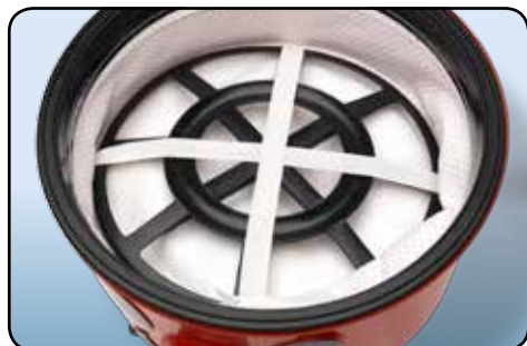
TriTex and HepaFlo high efficiency filtration system