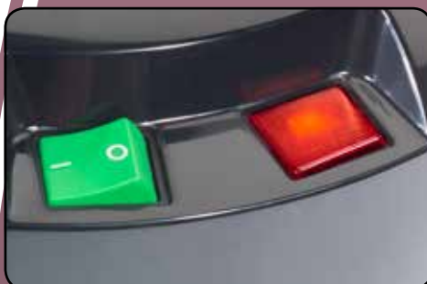
Power on indicator light