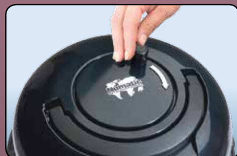
10m cable rewind and storage system