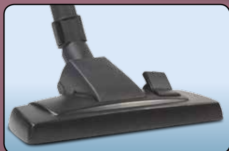
ProFlo high efficiency combination floor tool